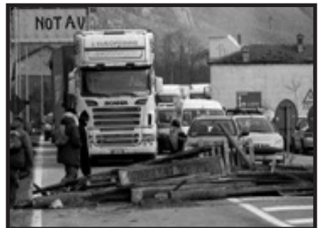
Barricade in Bussoleno

In 2005, construction for the TAV was underway at the mountain sports Olympic venue, Val di Susa. In the winter of 2005, residents of Val di Susa and supporters from many places came together to prevent the TAV by occupying a construction