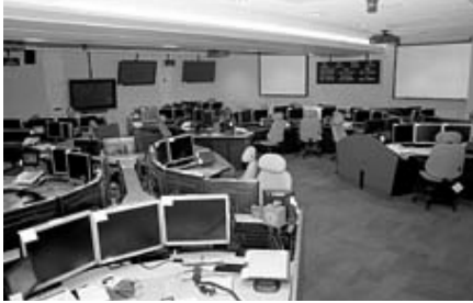
Global Operations Center, Offutt, NE, USA, a Kiewit contract

The injunction to remove the occupiers of the Eagle Ridge Bluffs camp was filed in May 2006 by highway construction contractors