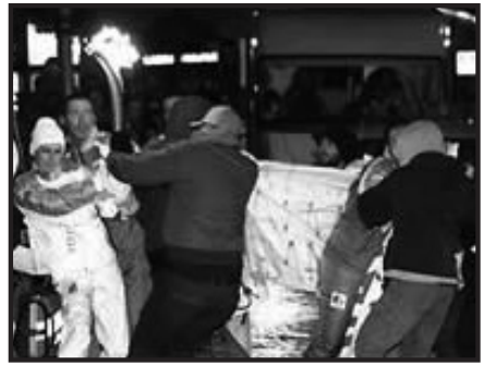
January 2006, anarchists snatch the Olympic torch, Trento, Italy January 2006

The planned route of the Olympic torch was diverted throughout Italy again and again. In Genoa, on December 18, 2005, a blockade forced the flame procession to stop and the flame to be transported in a car. In Trento, on January 23, 2006 the torch was snatched by