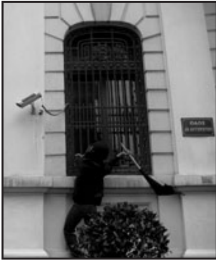
Breaking a surveillance camera Crete, Greece 2008

In Athens, November 2005, traffic was held up by a banner reading "Sabotage the Systems of Social Control", while at the same time comrades were setting the camera control boxes on fire. This was the second time these cameras were destroyed.