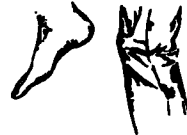
Lift foot high and maintain balance.